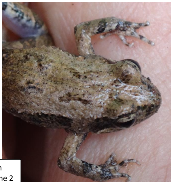
190403 Crinia pseudinsignifera BLEATING FROGLET LQ DSC08792