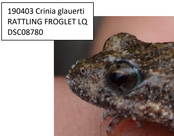
190403 Crinia glauerti RATTLING FROGLET LQ DSC08780