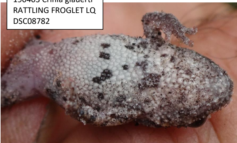
190403 Crinia glauerti RATTLING FROGLET LQ DSC08782