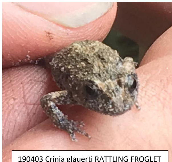
190403 Crinia glauerti RATTLING FROGLET LF IMG_0627