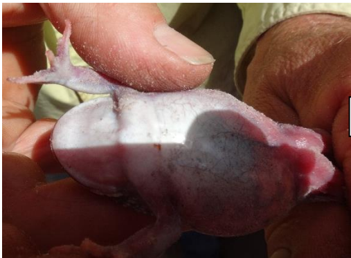
190402 Heleioporus eyrei MOANING FROG LQ DSC08725