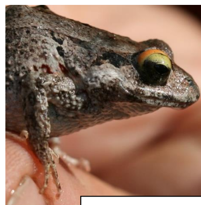
Crinia georgiana QUACKING FROG LF IMG_5793x