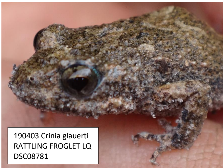
190403 Crinia glauerti RATTLING FROGLET LQ DSC08781