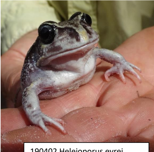
190402 Heleioporus eyrei MOANING FROG LQ DSC08724

No Tree Frogs (Hylidae) were captured during this survey. If they did happen to fall into a Pit Trap they would probably have easily jumped out anyway so the survey doesn't suggest that there are no Tree Frogs at Twin Creeks. All the frogs that were captured were Ground Frogs.