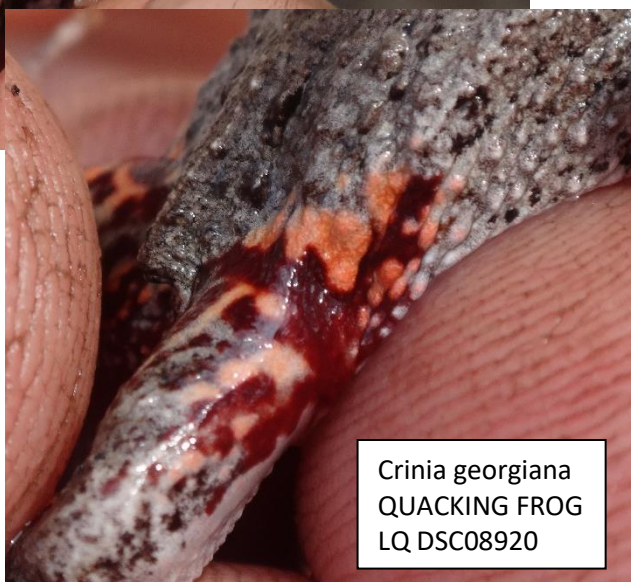
Crinia georgiana QUACKING FROG LQ DSC08920

Their bellies are granular and white but the male has a dark brown throat and distinctly larger arms. This specimen is a female.