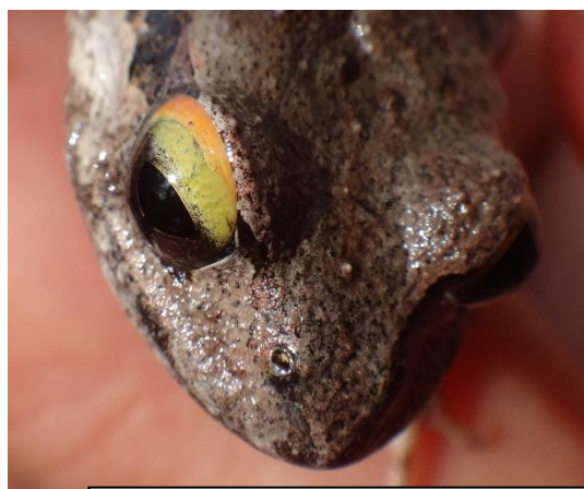
Crinia georgiana QUACKING FROG LQ DSC08923