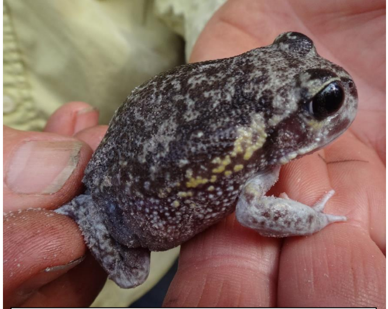
190402 Heleioporus eyrei MOANING FROG LQ DSC08721