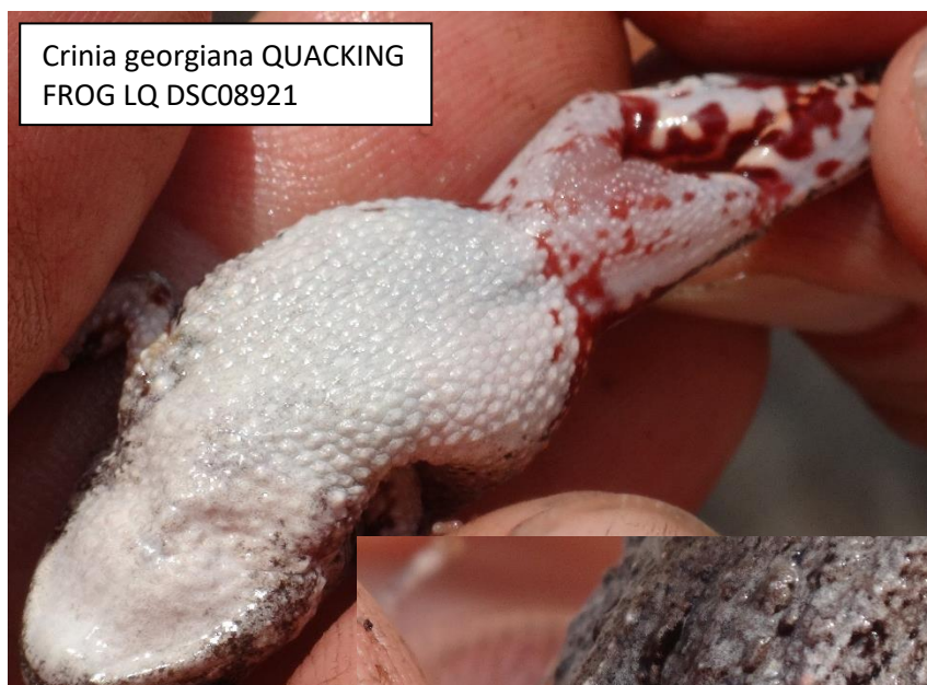
Crinia georgiana QUACKING FROG LQ DSC08921

Their bellies are granular and white but the male has a dark brown throat and distinctly larger arms. This specimen is a female.