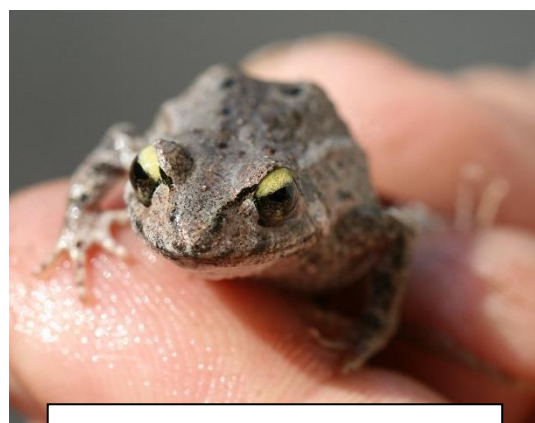
Crinia georgiana QUACKING FROG LF IMG_5788