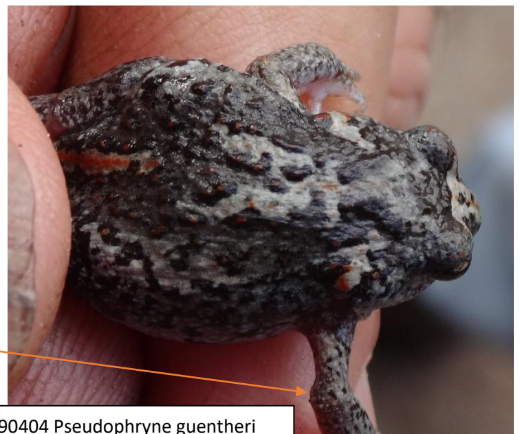
190404 Pseudophryne guentheri CRAWLING TOADLET LQ DSC08915