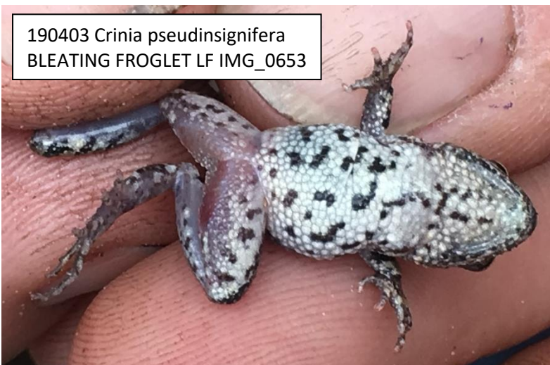
190403 Crinia pseudinsignifera BLEATING FROGLET LF IMG_0653